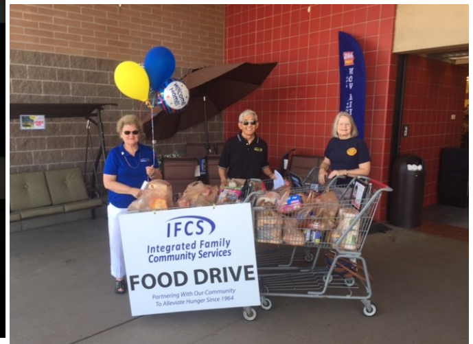
This past weekend our club held a food drive at the local King Soopers. Thanks to all.

Meals on Wheels. A volunteer is needed for July 15.